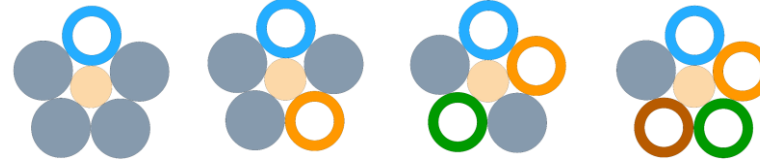
5 elements in the cable